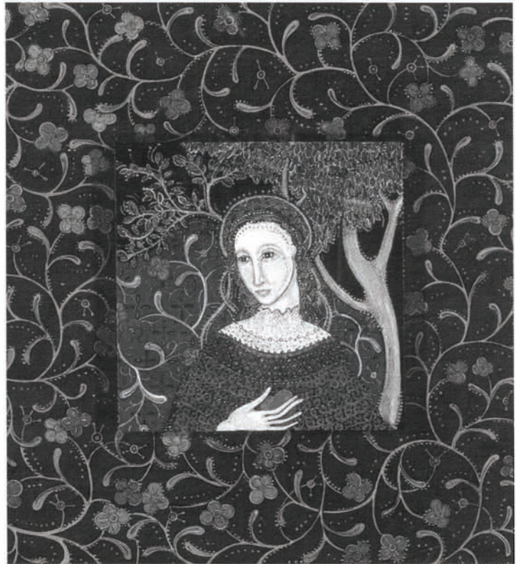
Sweet Grace , 2005-06 8 x 8 inches, ink, acrylic, goldleaf on panel courtesy of Stewart Gallery, Boise, Idaho