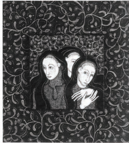
Melancholy, Sadness and Denial , 2005-06 8 x 8 inches, ink, acrylic, goldleaf on panel courtesy of Stewart Gallery, Boise, Idaho