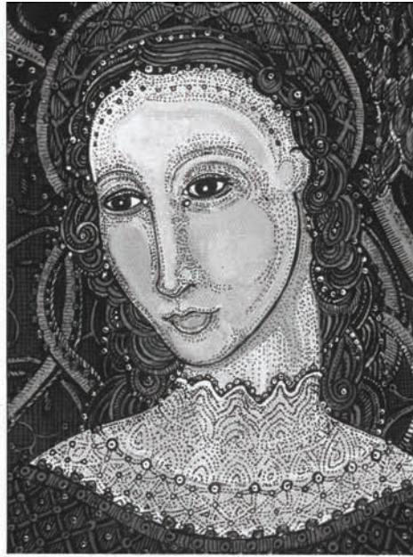
Detail from Sweet Grace , 2005-06 8 x 8 inches, ink, acrylic, goldleaf on panel courtesy of Stewart Gallery, Boise, Idaho