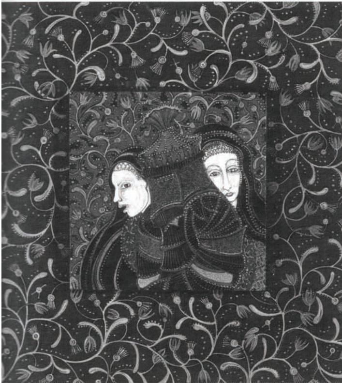
Black Knight of Trouble and Anxiety with Jealousy and Sloth , 2005-06 8 x 8 inches, ink, acrylic, goldleaf on panel courtesy of Stewart Gallery, Boise, Idaho