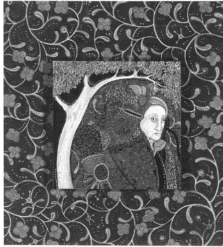
The Knight of Love, 2005-06 8 x 8 inches, ink, acrylic, goldleaf on panel